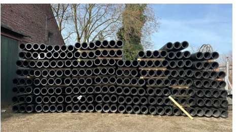
Top: installation of SIMONA pressure pipes by means of the ploughing method; bottom left: laying out the pipes; bottom right: SIMONA PE 100-RC Line pressure pipes

In 2023, Bewässerungsverband Pütz (Bedburg), a cooperative agricultural association, introduced an efficient and cost-effective water supply system for the purpose of irrigating arable land. The innovative system, featuring smart irrigation management, spans 20 km. It is designed to provide sufficient water for local fields, especially during dry summer periods, and thus ensure high-yield harvests. Among the key requirements of this pioneering project were environmentally friendly installation as well as the durability and robustness of the underground pipeline system. The German state of North Rhine-Westphalia provided funding of 5.6 million euros in support of this lighthouse project.