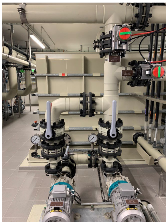
Top left: ventilation and deaeration line, neutralisation tank Bottom left: sludge water line, ultrafiltration unit Right: circulation line, neutralisation tank

As an \alpha -nucleated homopolymeric polypropylene (PP-H), SIMONA® PP-H AlphaPlus® is predestined for use in waterworks. The fine crystallite structure of the material has a particularly positive effect on the surface roughness of the internal pipe surfaces carrying the media. This greatly reduces pipe friction and minimises pressure losses. In addition, the extremely low surface roughness is a key quality criterion when it comes to mitigating the risk of adhesion to the inner pipe surfaces and thus contamination of drinking water. These properties also proved to be a compelling proposition for our partner Keller Industriemontagen, who opted for SIMONA's PP-H AlphaPlus® products, among others, when selecting materials for the project.